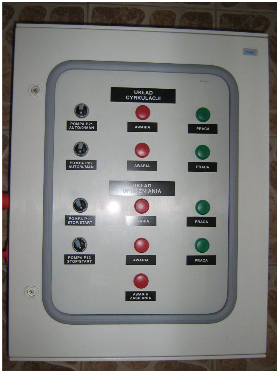
Picture 1. External view

The device is dedicated to control a four pumps in Hot-Dip Galvanizing Plant. Two pumps are intended for filling and purging a tubes. Two other pumps provide efficient circulation of the medium in the tubes.