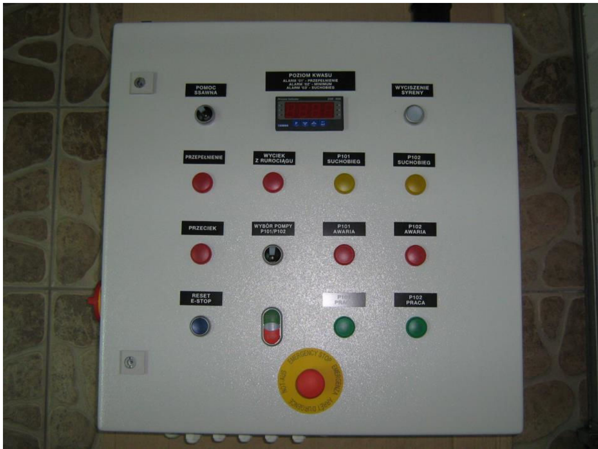
Picture 1. External view

The system is dedicated to supply a car battery production line in sulfuric acid. The medium is stored in the storage tank. The level of acid in the tank is monitored by an ultrasonic sensor. In addition the tank is secured by overflow and leakage sensors. The installation is equipped with protection against dry running of pumps.