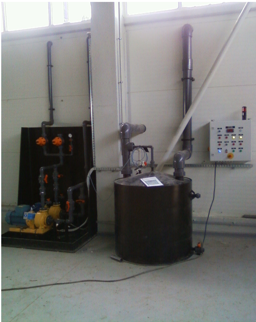
Zdjęcie 3. Installation location